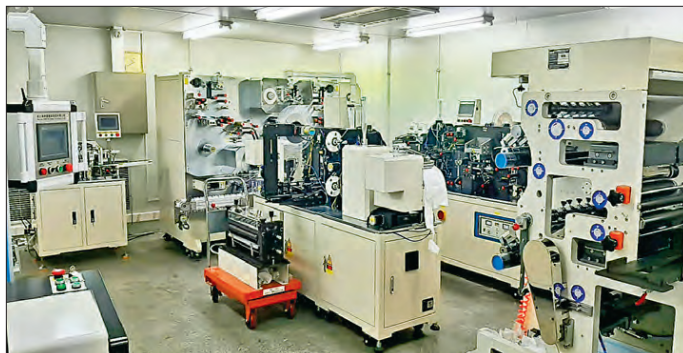
Assembly Line Equipments Inside 1% RH Dry Room for Making 1000 cells/day

Contributed by: Science Media Communication Cell (SMCC), CSIR-NIScPR, New Delhi.