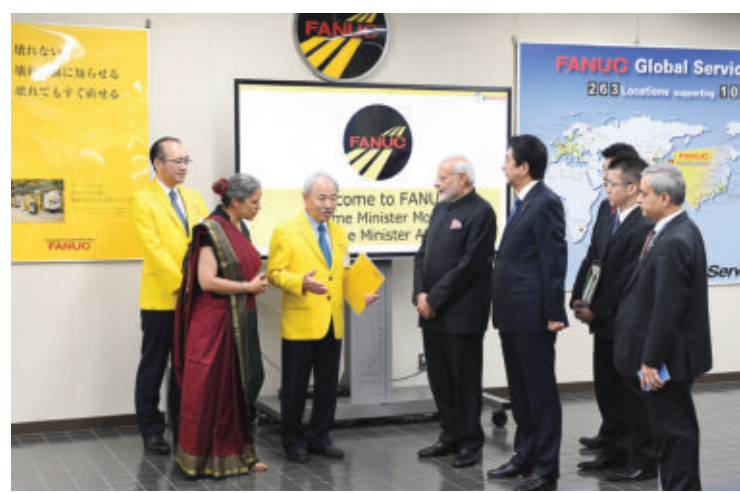
The Prime Minister, Shri Narendra Modi and the Prime Minister of Japan, Mr. Shinzo Abe visiting the FANUC Corporation, at Yamanashi, Japan on October 28, 2018.

showcased their determination to face the challenges of terrorism together. They agreed to "strengthening cooperation against terrorist threats from groups including Al Qaeda, ISIS (Islamic State), Jaish-e-Mohammad, Lakshar-e-Tayyiba, and their affiliates". They called upon Pakistan to bring to justice the perpetrators of terrorist attacks, including those of November 2008 in Mumbai and January 2016 in Pathankot.