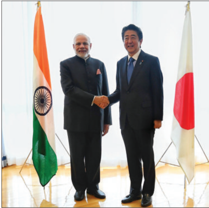
The Prime Minister, Shri Narendra Modi meeting the Prime Minister of Japan, Mr. Shinzo Abe, at Yamanashi, Japan on October 28, 2018.

Based on the solid foundation of civilisational and centuries-old cultural links, India and Japan now seek to provide economic and political rationale to their deepening geo-strategic relations. The fact is that there are growing number of areas of convergence, commonality and common vision between the two Asian powers. Therefore, after years of hedging, they seek to strengthen their multi-faceted partnership, ranging from digital to cyberspace, health to defence, from oceans to space and agriculture to food processing. From reforming the United Nations Security Council to make it more relevant to the present world to keeping the