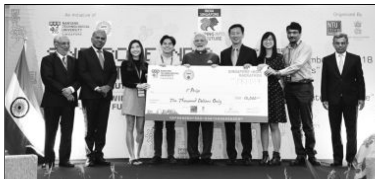
The Prime Minister, Shri Narendra Modi presenting the awards to the winning team of India-Singapore Hackathon 2018, in Singapore on November 15, 2018.

India's bilateral relations with the US were in focus when Prime Minister Mr. Modi and US Vice-President Pence met on the sidelines of the East Asia Summit. India and the US discussed their roles in Indo-Pacific region and cooperation in defence and trade sectors, amid simmering differences over New Delhi's oil import from Tehran and purchase of S-400 Triumf missile system from Russia.